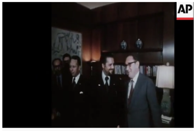
SYND 6-12-73 SHEIKH YAMANI AND KISSINGER MEET ON OIL, YAMANI TALKS TO PRESS CONFERENCE

I do not share the opinion of some specialists (though there are highly reputable people) that in 1986, prices collapsed as a result of a deliberate conspiracy between the US and the KSA (specifically, Kissinger and Yamani, who were well acquainted with each other) in order to undermine the economic power of the USSR, which at that time was supported by the oil export. I believe the KSA was defending its national interests, which it had consistently compromised since the early 1980s, step by step yielding its market share, to those OPEC countries that did not comply with the quota discipline.